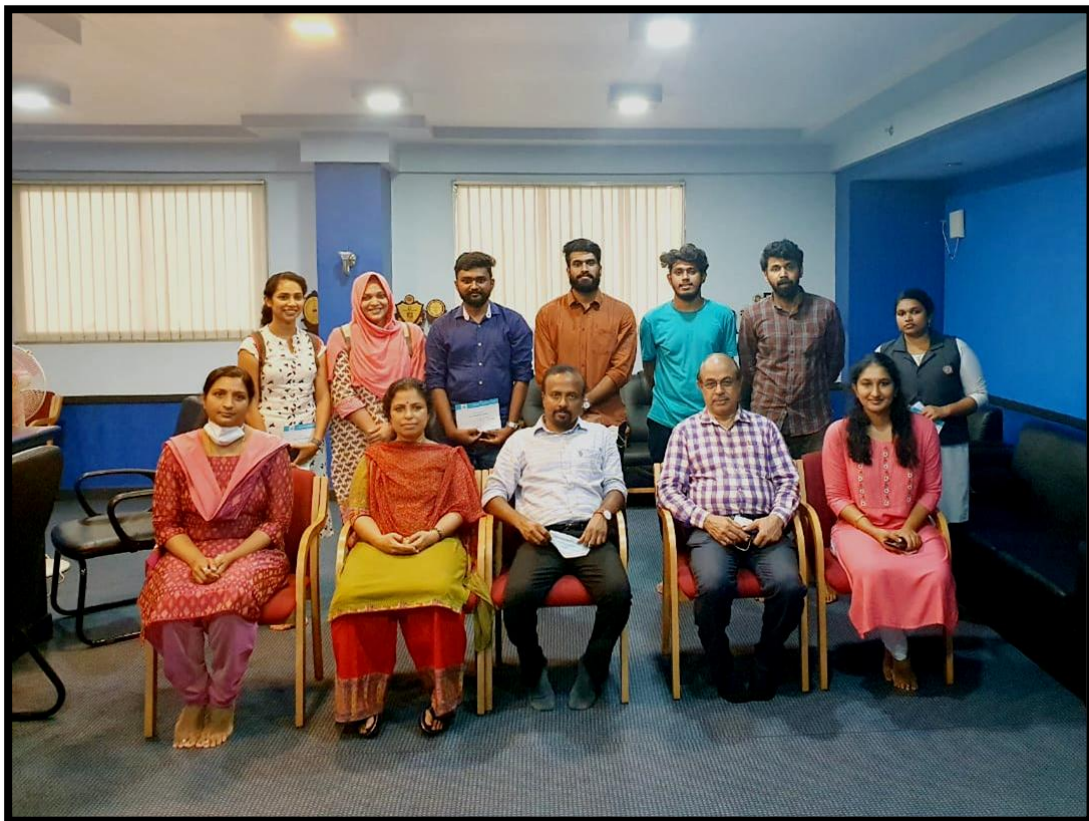
Volunteers were also appreciated by the Principal of the institution